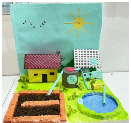
Irrigation by Rain Water