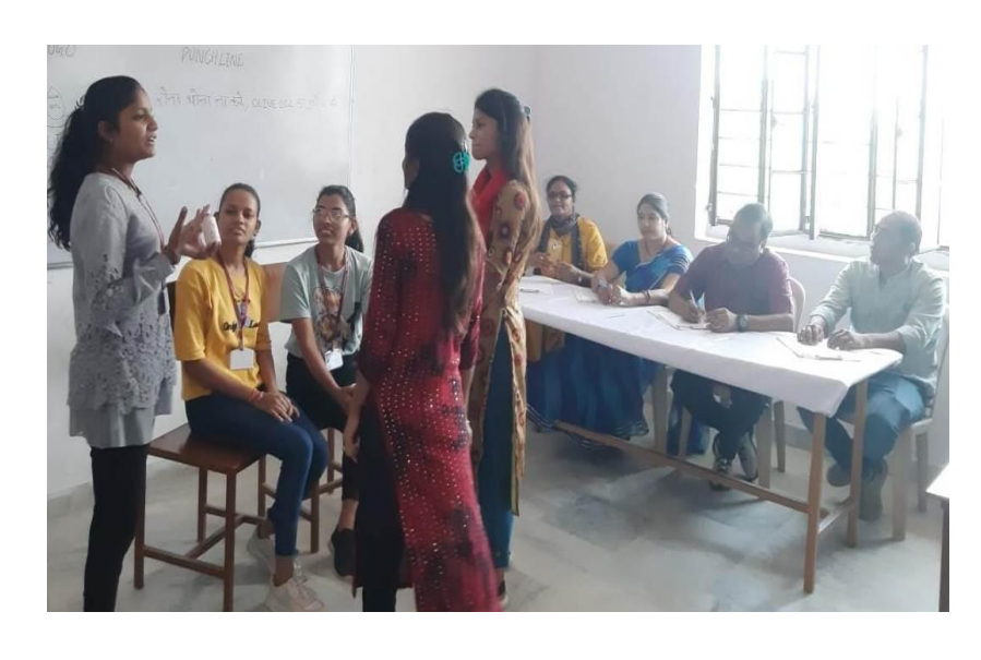
Ad Mad Competition