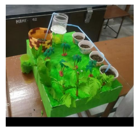
Sprinkler Irrigation System